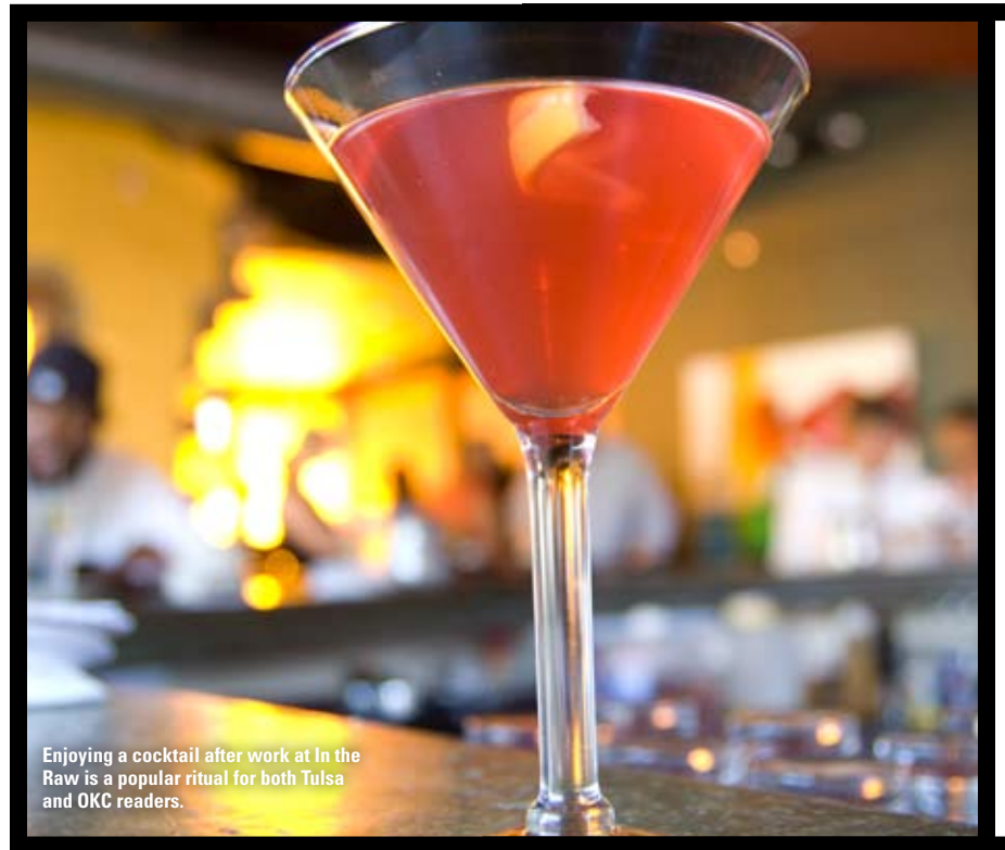
Enjoying a cocktail after work at In the Raw is a popular ritual for both Tulsa and OKC readers.

A great wine can turn a satisfying dish into an incomparable dining experience, and inter-